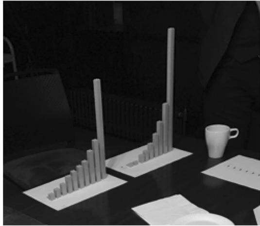
Fig. 3 Brick renderings of the actual distributions of income (left) and wealth (right) in the UK today

They typically began by spreading the bricks out across the table in front of them, before discussing and deciding how to organize them. Rarely, groups wrote down notes or calculations before arranging their bricks. More commonly, they started assembling bricks into stacks and then continued their discussion and moved bricks between the different stacks until their adjustments “looked about right.” Importantly for our purposes, participants appeared to be comfortable with the task’s distributional character. Few asked for clarification as to what the bricks represented. Thinking about bricks in terms of percentages of the overall income or wealth in the UK seemed relatively effortless. For example, here is how one subgroup reported going about the wealth task in our second focus group: